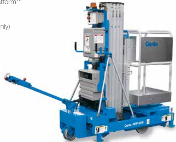
Shown with optional power wheel assist

* Adds 12.5 in (.32 m) to unit length and 285 lbs (129 kg) to unit weight, DC only ** Not available with Outreach package