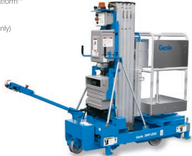
Shown with optional power wheel assist

* Adds 12.5 in (.32 m) to unit length and 285 lbs (129 kg) to unit weight, DC only ** Not available with Outreach package