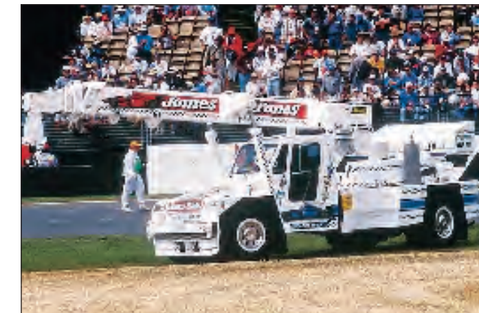
MELBOURNE F1 GRAND PRIX.