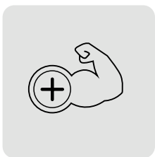
Terex Power Plus