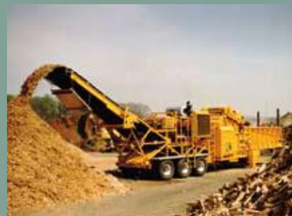
Construction wood to high-quality fuel