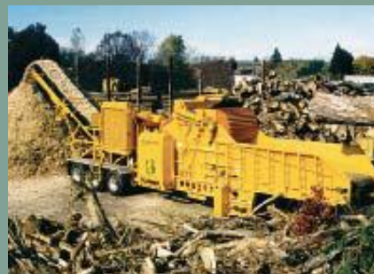
Logs & stumps to mulch or boiler fuel