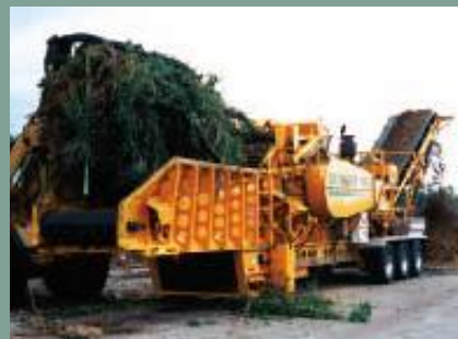
Yard waste to compost