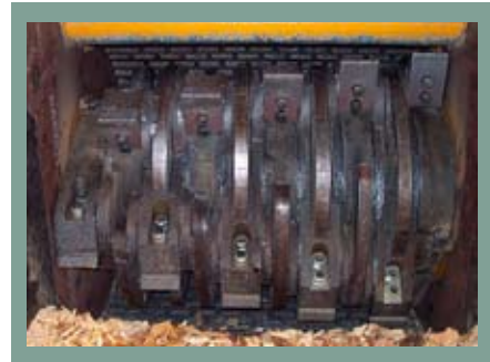
Solid Steel Rotor with optional Brute Package and bolt-on strikers. Perfect for contaminated C&D, railroad ties, telephone poles, etc.

Rexroth and Sauer hydrostatic closed-loop hydraulic pumps are used, which generate less heat and less component stress while prolonging equipment life. Single function fusing and wiring, with terminal blocks, is well-routed in harnessed cables, extending component life, simplifying maintenance and providing a better overall appearance. Each subassembly is sandblasted, epoxy primed and painted completely before final assembly, using CBI's extended life painting process resulting in enhanced corrosion resistance, better appearance, and better resale value.