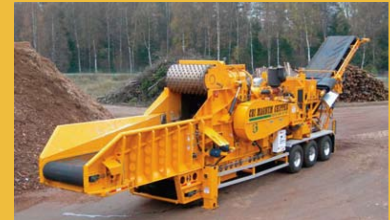
European Chassis Shown