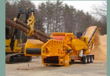
Pole wood to micro chips