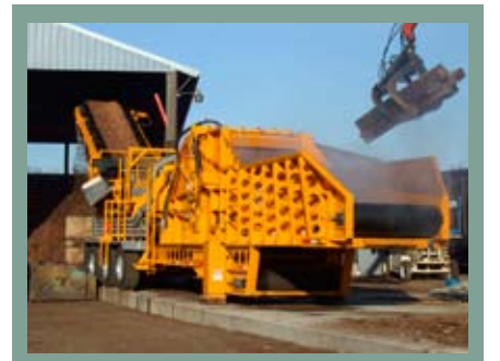
Processes railroad ties, telephone poles, and other highly contaminated materials without missing a beat.