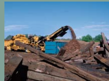
Railroad ties to hog fuel