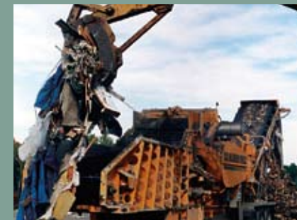
C&D to alternative fuel