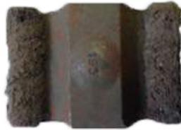
3" FANG TIP

Description: All-purpose tip for all varieties of materials and applications. Best overall wear life.