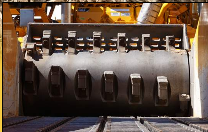
OFFSET HELIX PATTERN ROTOR