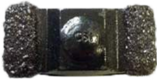
2" FANG TIP

Description: Aggressive for high throughput. Ideal for first grind and general volume reduction.