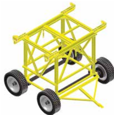
4 Wheel Travel Dolly