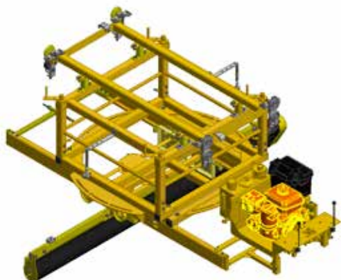
Skewable Sidewalk Paver

Bid-Well offers a large selection of options and accessories for the 3600RC model roller paver ranging from carriage fogging systems to weight distribution systems and traffic machine ends for skewed paving. Shown are just a few of the options available for contractors to equip their 3600RC to meet any job specification. For more information on available options and accessories for the 3600RC model roller paver, contact your Regional Sales Representative or the Bid-Well Applications Department at +1 605-987-2603.