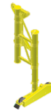
6 in / 15.2 cm swing leg