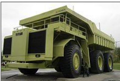
The Titan prototype produced was in service until 1990 and is on display in Sparwood, British Columbia, near the mine it served. It remains the world's largest truck by dimensions.