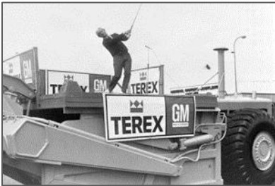
Golfer Jack Nicklaus Hitting Shots from a 'Tee' on a Terex TS-24 Overhung Scraper.