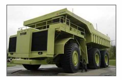
The Titan prototype produced was in service until 1990 and is on display in Sparwood, British Columbia, near the mine it served. It remains the world's largest truck by dimensions.