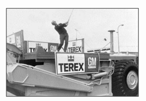
Golfer Jack Nicklaus Hitting Shots from a 'Tee' on a Terex TS-24 Overhung Scraper.

GM's Terex Division creates some of the industry's biggest heavy construction equipment, including the world's first off-road hauler (1Z Trac-Truk), first twin-powered dozer (TC-12) and largest truck, the Terex 33-19 "Titan" – as well as the first TS-8 for the British Army, an all-wheel-drive twin-engine scraper, transportable by aircraft.