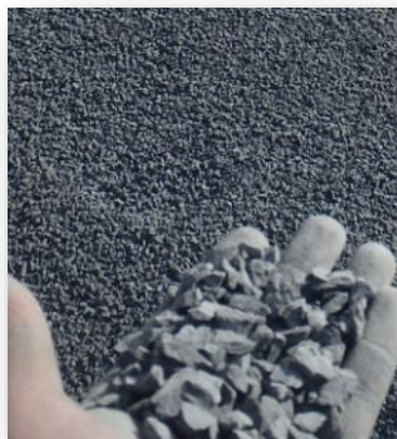
Mid-overs Product 12-7mm