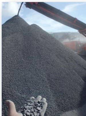
Oversize Product 16-12mm

Average Fuel Consumption Engine: CAT C4.4 Stage IIIA Constant Speed 98kW (131hp) @ 1800RPM Litres per Hour: 15 l/hr (3.96 US gal/hr) (T-Link average)