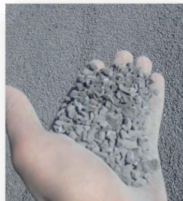
Mid-unders Product 7-4mm