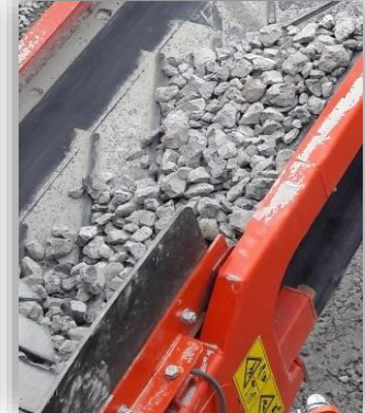
Oversize Plus Product