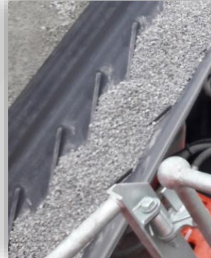
Middle Grade Product