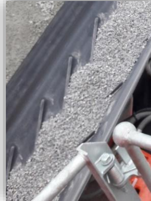
Middle Grade Product