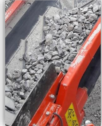
Oversize Plus Product