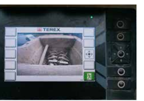
Chamber Camera (Option)