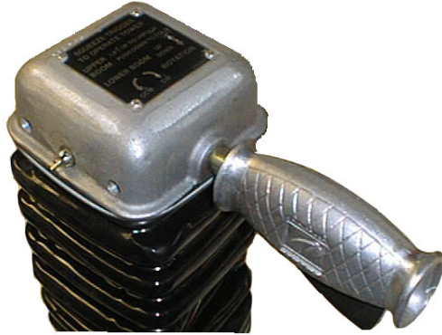
3D Single Stick

Shown are the two types of single lever controls that are available. The 3D Single Stick style is used on open center that is mounted directly on a spool valve or for closed center units mounted on a pilot control body. The PTE Single Stick is used only on open center units mounted directly on a spool valve.