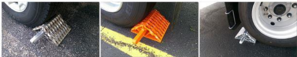
Original 8500-AL – 12,500# Cap.

The 8500-AL All Weather Aluminum Wheel Chock can be identified by its aluminum construction and straight faced handle. It is shown on the left below along with the replacement options.