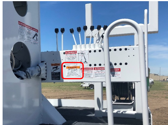
Figure 2. Typical decal location for handle rack operator's station

The decal for digger derricks is part number 485894, as shown in Figure 3. The decal for aerial devices is part number 468476A, as shown in Figure 4.