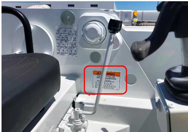
Figure 1. Typical decal location for command post operator's station

Inform all users and service personnel that the incorrect decal may be installed on their machine, which will refer them to the incorrect ANSI standard. The correct standard for a digger derrick is ANSI A10.31. The decal will be located near the control station as shown in Figures 1 and 2.