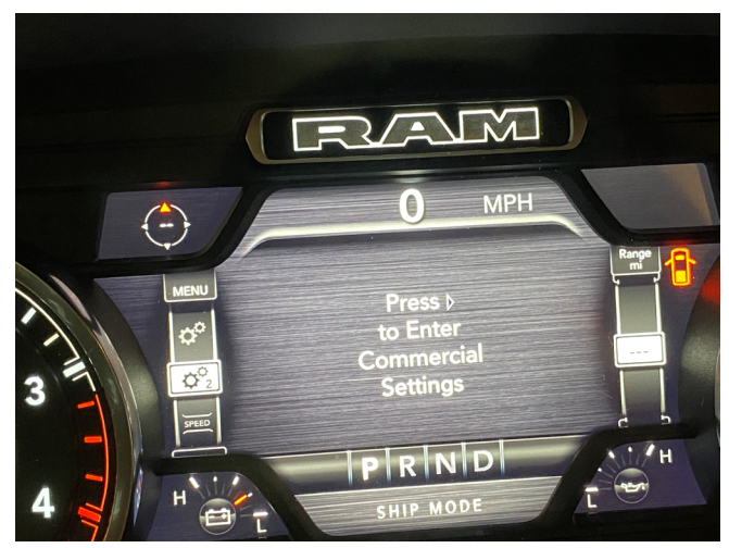
FIGURE 3 - 2022 and newer