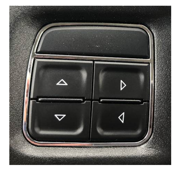
FIGURE 1 - 2021 and older

Using the arrows on the steering wheel, scroll through the cluster to find Settings.