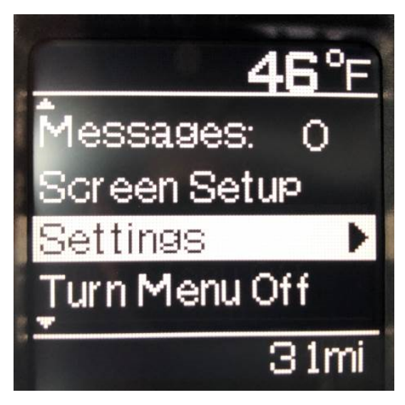
FIGURE 2 - 2021 and older