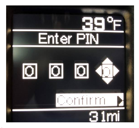
FIGURE 5 - 2021 and older

The Dodge Factory Pin is: 0000. Terex Utilities does not assign new pins to the vehicles. Enter the Pin and press the right arrow to continue.