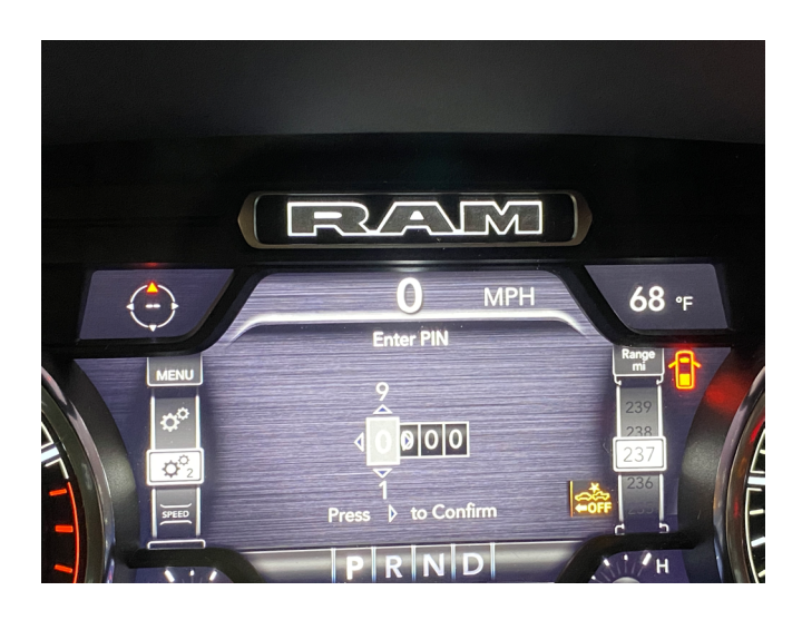
FIGURE 6 - 2022 and newer