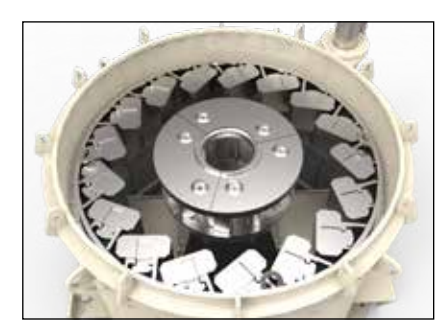
Rock on Anvil

Shoe and anvil configuration offers high tonnage of chip production, high reduction ratios and feed size flexibility.