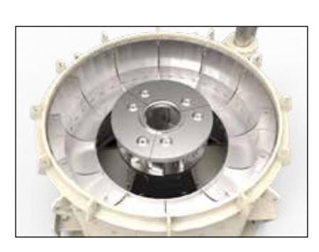
Rock on Rock

Enclosed rotor and anvils combine the grinding action of the rotor with the high efficiency reduction of anvils.