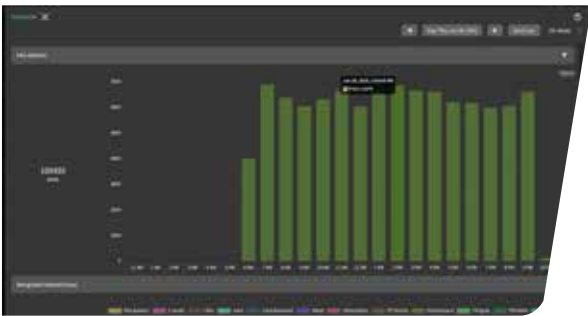
Picks per hour